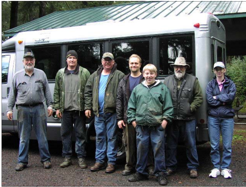
A Pretty Soggy Crew